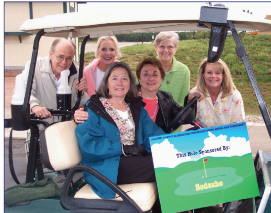
2004 volunteers with hole sponsor placard.

Placard at each hole sponsored, publicity package